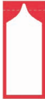
Bottle Neck contour