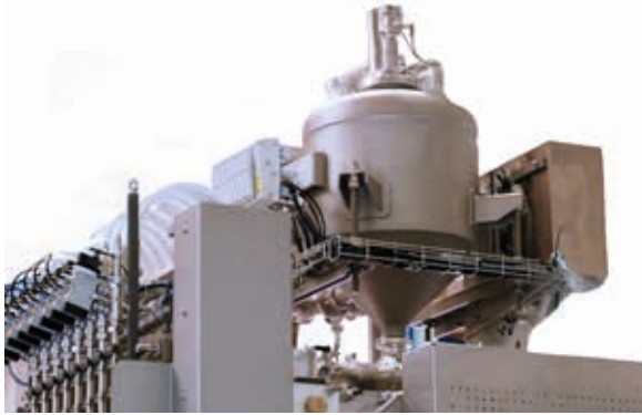
Filler for liquid and pasty products