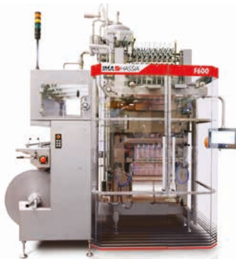
F600 / F800 SIMPLEX

The F-series produces 4-sided-sealed sachets for consumer, cosmetics and pharmaceutical products.